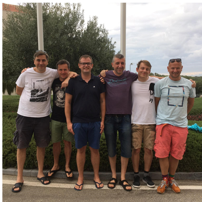
Bridge24.pl - Winners of the Open Teams