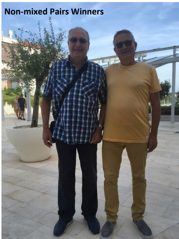
Non-mixed Pairs Winners