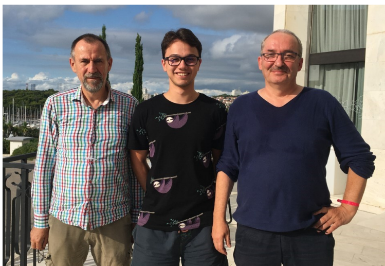
Non-mixed Teams Winners 2021: KONKRET of Poland