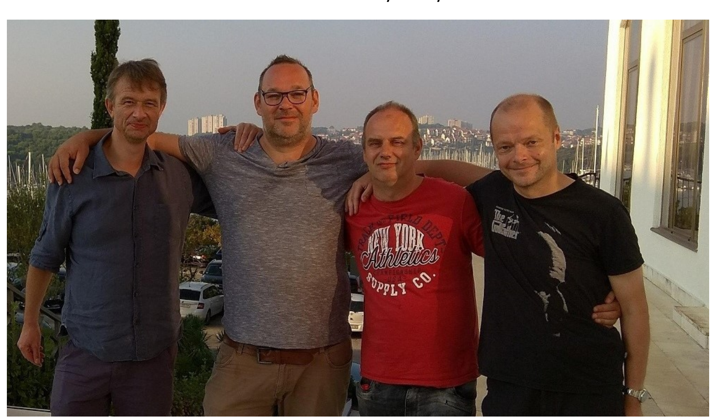
2018 Open teams winners