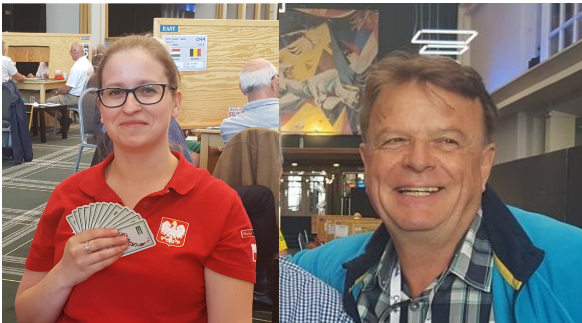
Lara Mixed Pairs winners