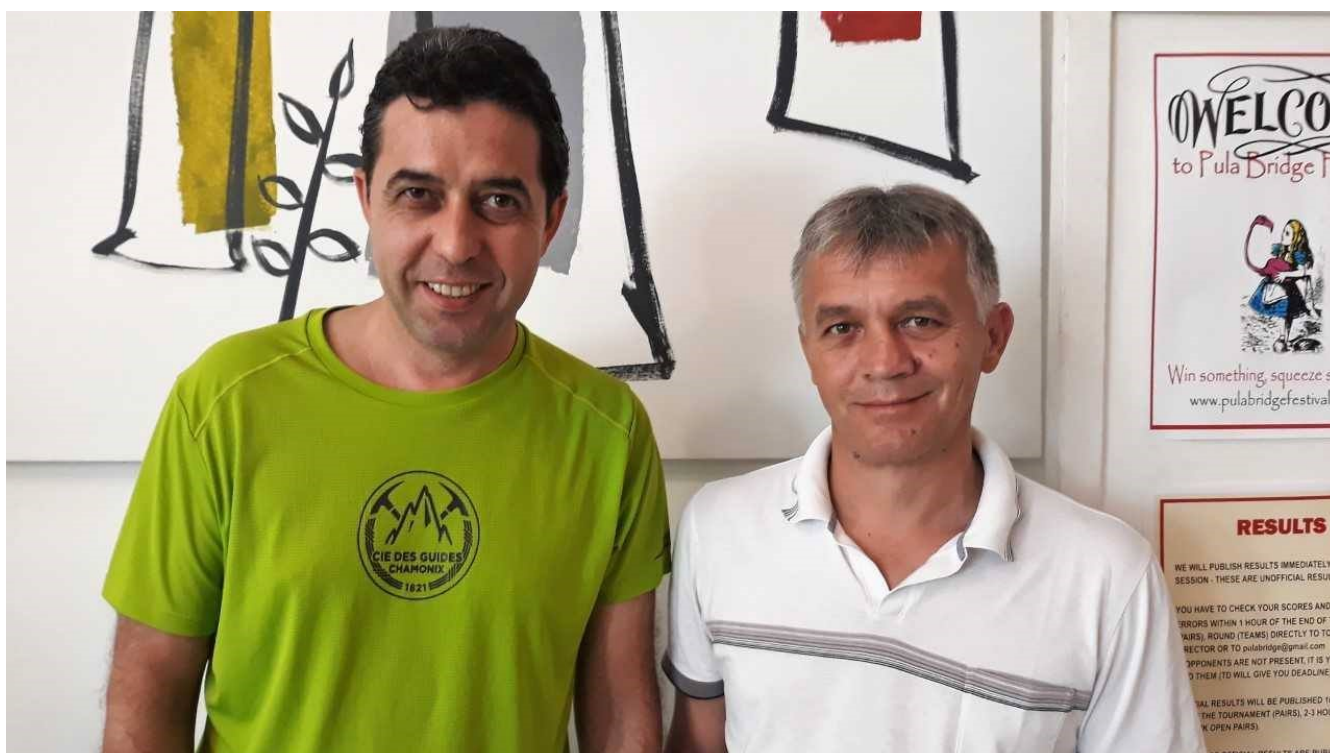
Non-mixed Pairs winners