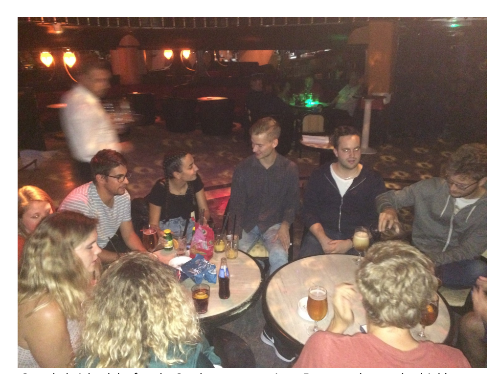
Crowded night club after the Sunday teams sessions. Everyone deserved a drink!