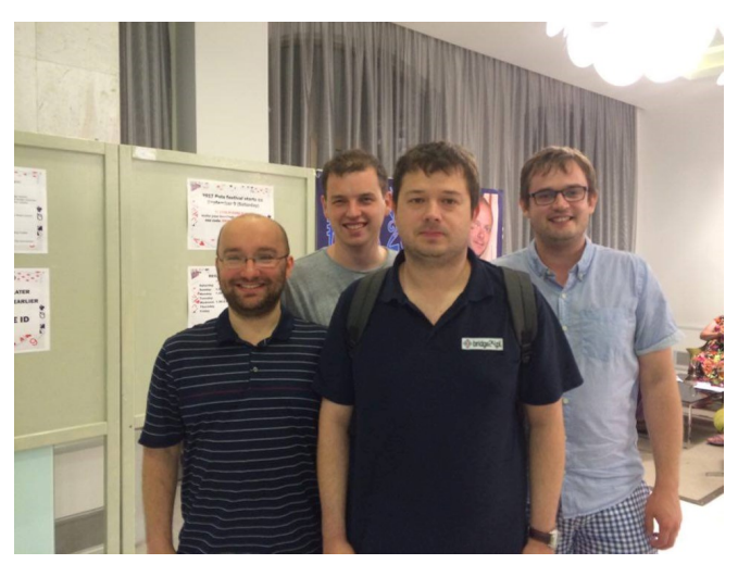
2016 Open team winners