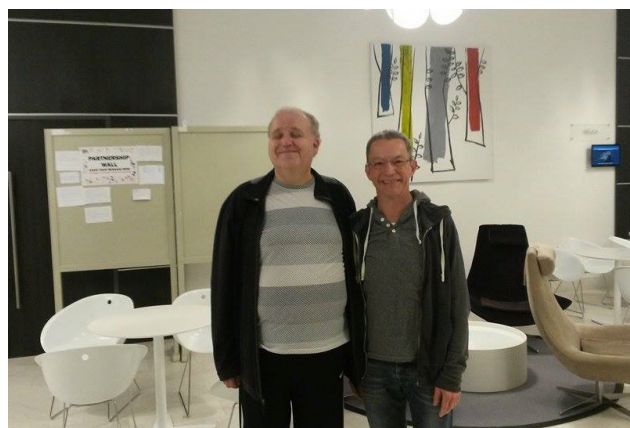
2016 Non-mixed pair winners