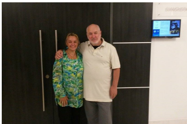
2016 Mixed pair winners