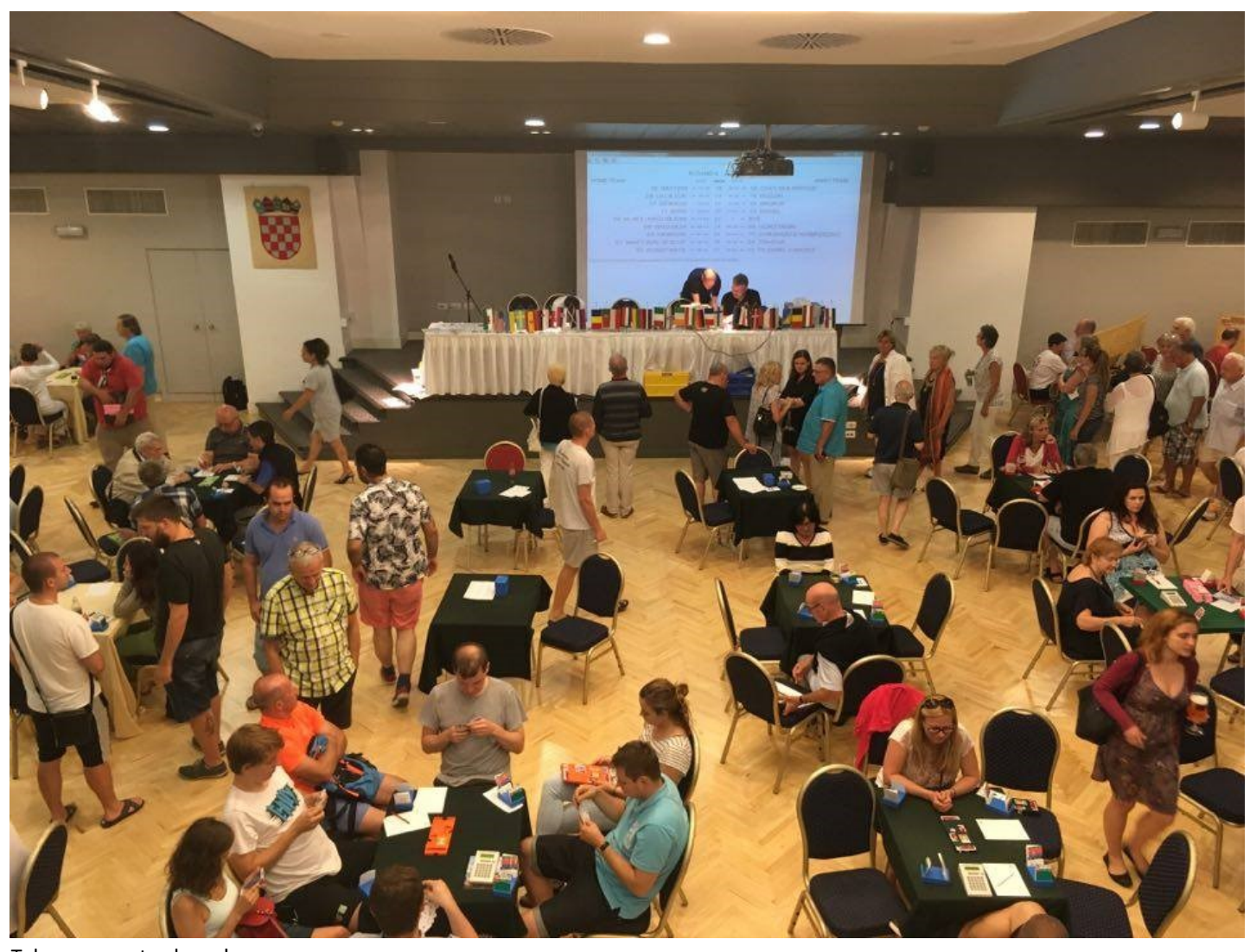
Take your seats please!

Partnership desk (wall) is right next to Registration desk. Leave your message there!