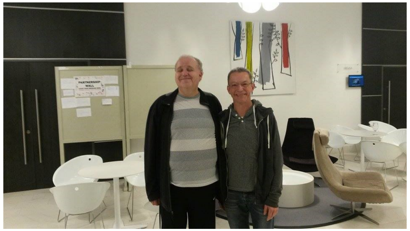
Lara Non-mixed Pairs winners