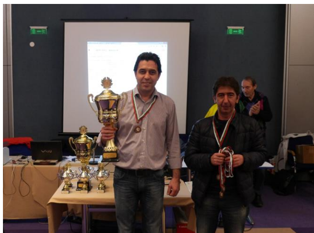
2014 Brk open pairs winners