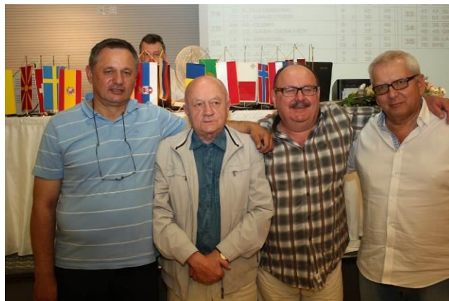
2014 BAM winners