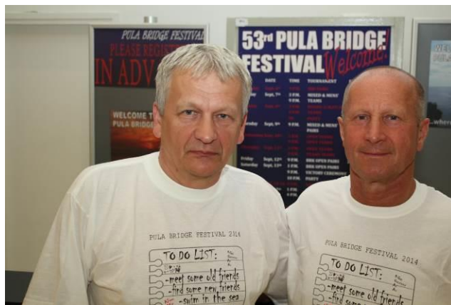
2014 Men's pair winners