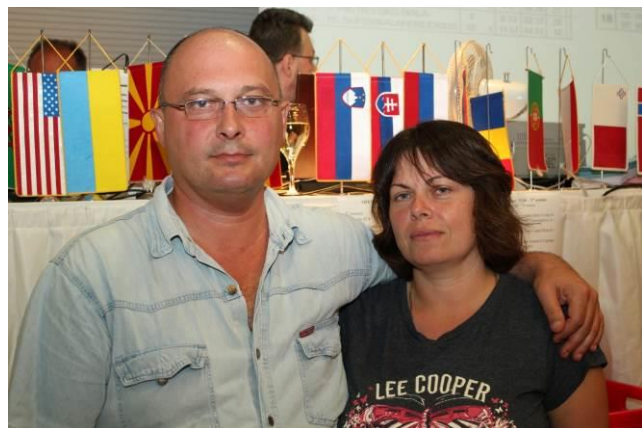
2014 Mixed pair winners