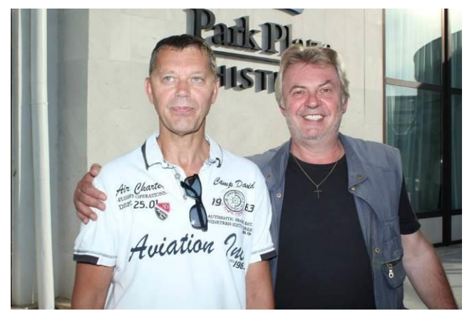
2013 Brk open pairs winners

We shall finish this official part of the article with results from the past and then you will find some more information about party: