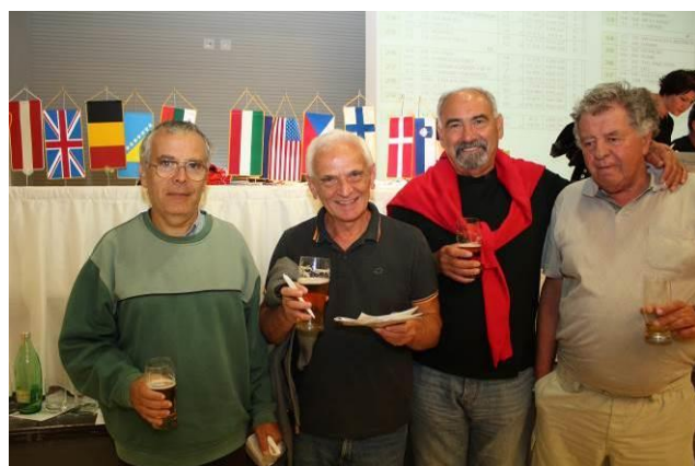
2013 Open team winners

Let take a look at the open teams winners last five years: