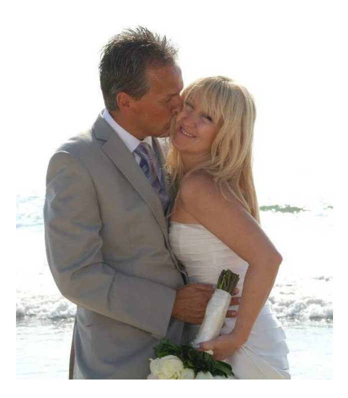
8. What do you do when you don't play bridge? What are your other passions?